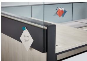
Bare Panel Shield Magnetic Fascia