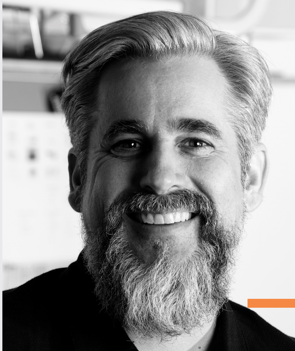
Fig40 is a Toronto based industrial design studio driven to developing relevant, sustainable and award-winning products that inspire collaboration – collaboration between people, and collaboration between design and manufacturing. The outcome is a design that is not only engaging and relevant but also a solution for bringing people together in organic and deliberate ways.