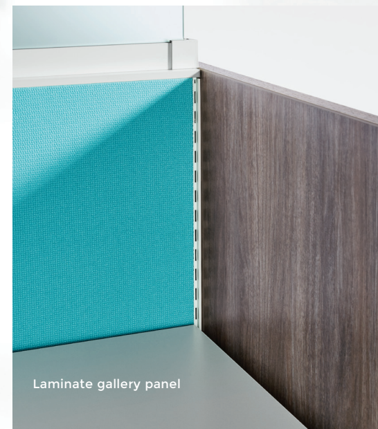
Laminate gallery panel