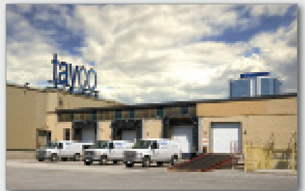
Manufacturing Facility, Norris Glen building, Toronto