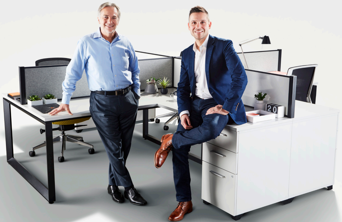
Head Office, 400 Norris Glen Road. Toronto, Ontario M9C 1H5