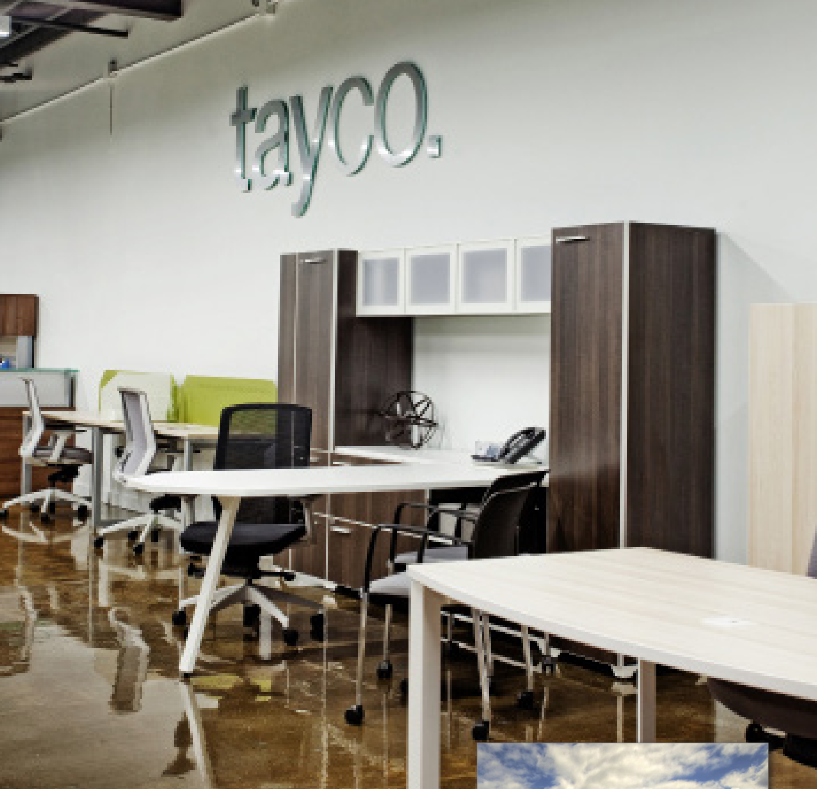
Head Office, 400 Norris Glen Road,