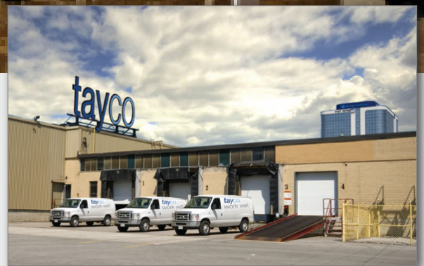
Manufacturing Facility, Norris Glen building, Toronto